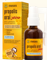
PROPOLIS ORAL JUNIOR